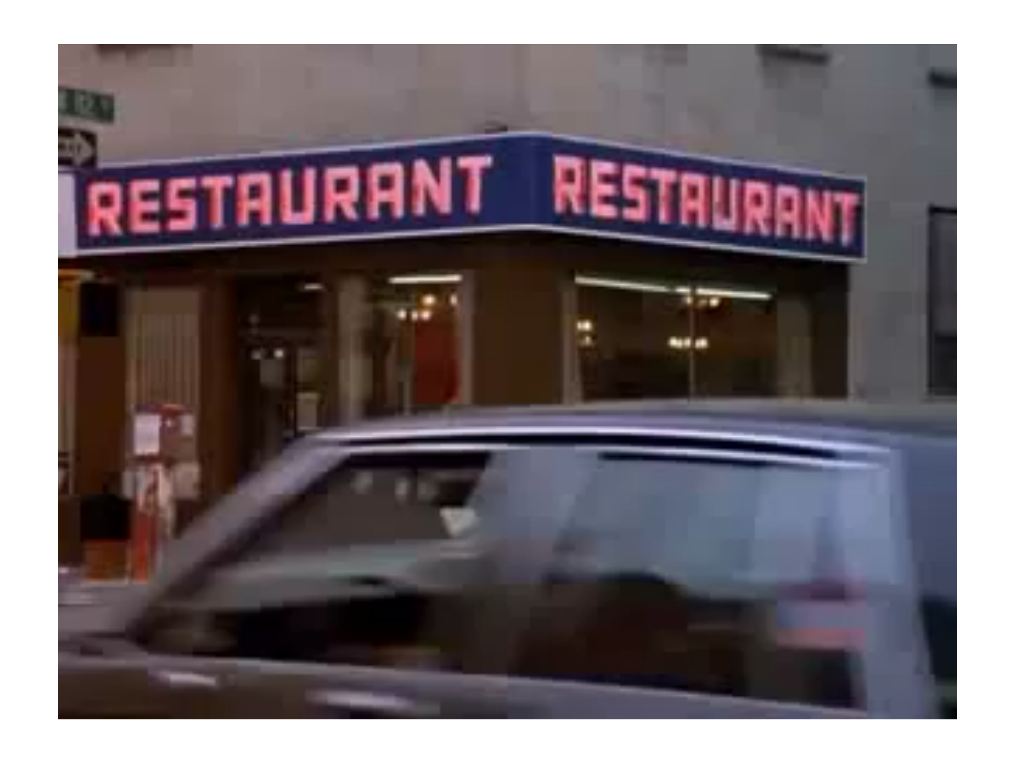
It's Not You It's Me!